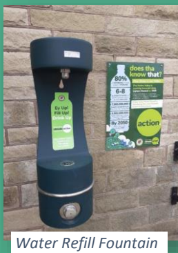
Water Refill Fountain

We held a poster competition for all primary schools with winning posters presented and displayed in each school