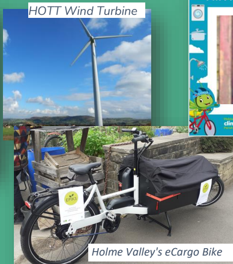
HOTT Wind Turbine